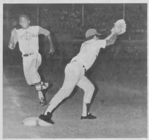
Baseball at Sport Park